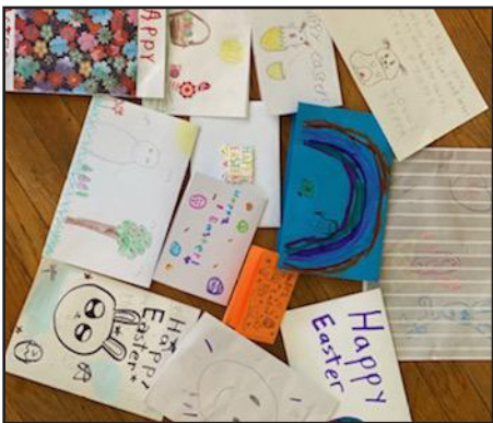
Brownie Troop 70791 donated Easter goodies and created hand-drawn cards to be tucked into the baskets.