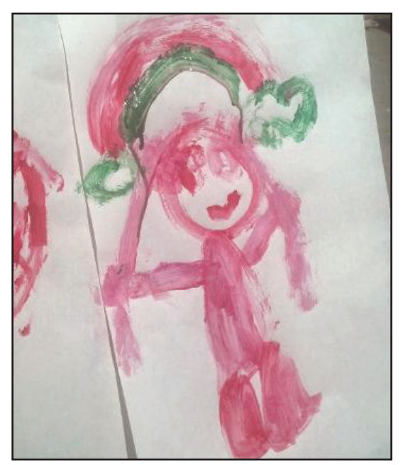
ART HEALS: Donated art supplies provide welcome distraction and help children cope with the effects of trauma.

FCP friends and supporters have stepped up to help FCP's Adopt a Child Abuse Caseworker (ACAC) Program, as well as some of our partnering agencies, including My Friend's Place, Hathaway Sycamores, Optimist