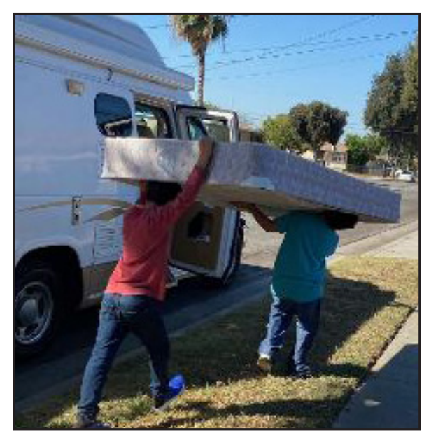
SPECIAL DELIVERY: Filled with excitement, two brothers insist on carrying a donated mattress into their home.

Heather: This young teenage girl was removed from an environment deemed unsafe because of parental drug use and neglect. Now living with relatives, she finds art and reading to be calming