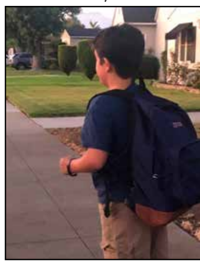
SETTING OUT: Starting school with confidence and enthusiasm... and a new backpack!

Until a couple of years ago, three members of the ACAC team bought a number of standard, not-very-interesting backpacks and filled them with the basics. That early effort got backpacks and school supplies to a small circle of children who needed them. Then we opened up the project to the community, and the community responded with joyful enthusiasm, significantly expanding our reach. Thanks to all who participated. We are wonderfully overwhelmed.