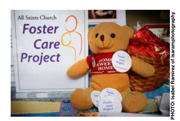
A SYMBOL OF COMFORT: A teddy bear graces the Foster Care Project information table on Featured Ministry Day

At 7:30 p.m., All Saints Church capped off the special day by bathing the church property in blue light, as part of the "Seen Campaign," organized by FCP's partnering agency Five Acres. The symbolic blue light served as a beacon to raise awareness of the more than 20,000 children in Los Angeles in need of permanent families. FCP salutes our partners and community supporters as we continue our ongoing efforts—encouraging volunteerism, donations, and fostering-on behalf of our most vulnerable children and families.