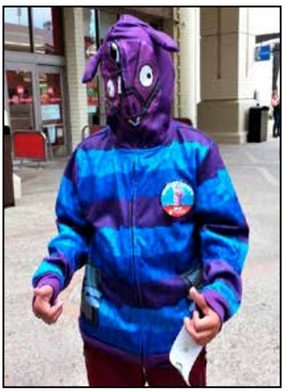
THUMBS UP! One of our young shoppers was thrilled to find a jacket based on the character "Loot Llama."