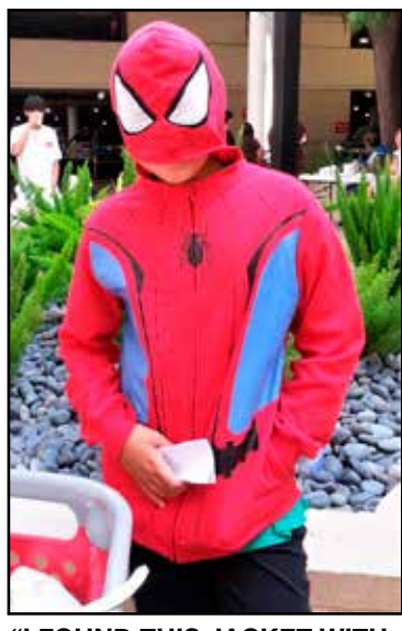
"I FOUND THIS JACKET WITH MY SPIDEY SENSE:" Spider-Man, a perennial favorite need we say more?

Volunteers helped manage a $200 gift card and provided individualized attention and guidance on the purchase of shirts, pants, school uniforms, jackets, shoes, and socksensuring that each child would go back to school "in style," with bolstered confidence. The kids bonded with their volunteers, sharing immediate goals ("to do well"