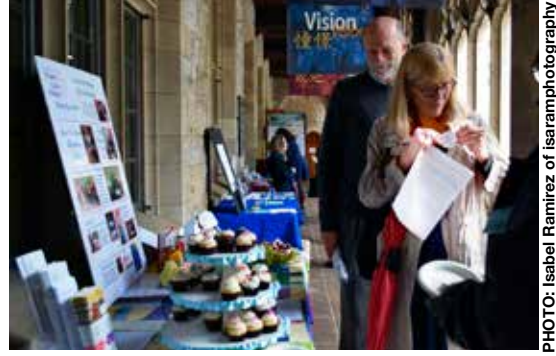
CUPCAKES AND CARING: Visitors pick up information—and a Foster Care Project button-at FCP's table.