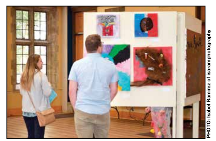
PACKING A PUNCH: Spectators view several emotionally charged pieces, including a powerful contribution by a teen girl from Maryvale, entitled "Coping."