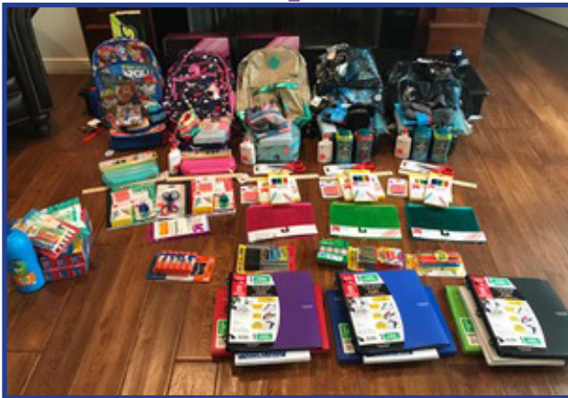
Backpack Bounty: A sample of the backpacks and school supplies donated during FCP's highly successful 2018 backpack drive.