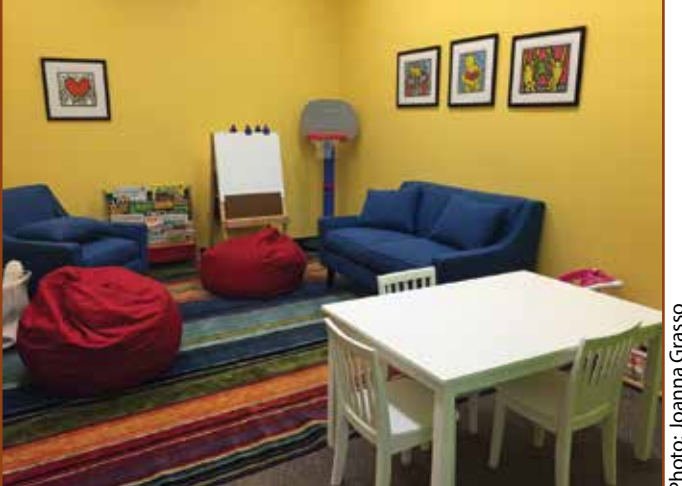
The visitation room at Barrio Action is a bright and welcoming place for families to reconnect during court-ordered, monitored visits.

n July 21, a special "meet and greet" was held at Barrio Action. The purpose was twofold: 1) to let the El Sereno community know that Family Connect Pasadena, Barrio Action and the Department of Children and Family Services (DCFS) had partnered to provide a new, local visitation site for court-